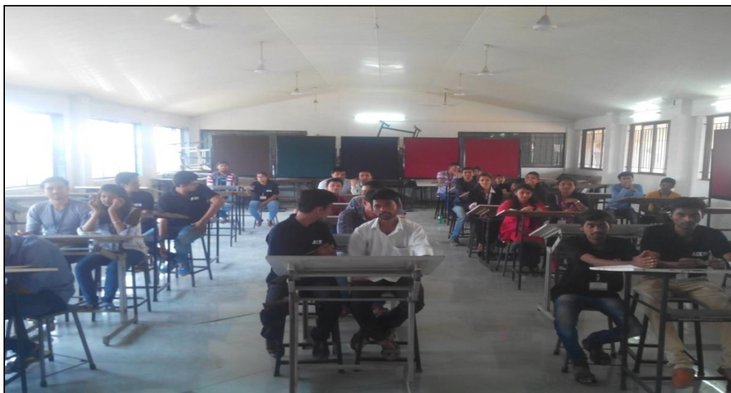
Students during poster making competition