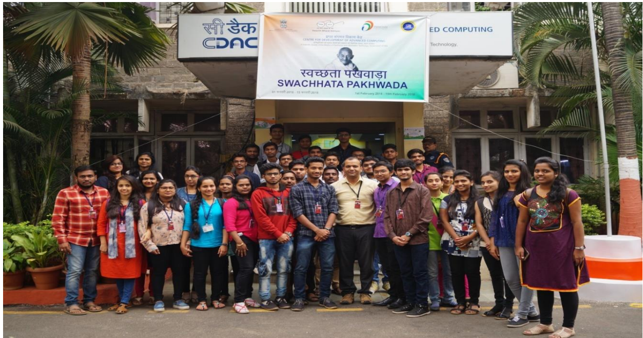
Industrial Visit to CDAC-Supercomputer, Pune