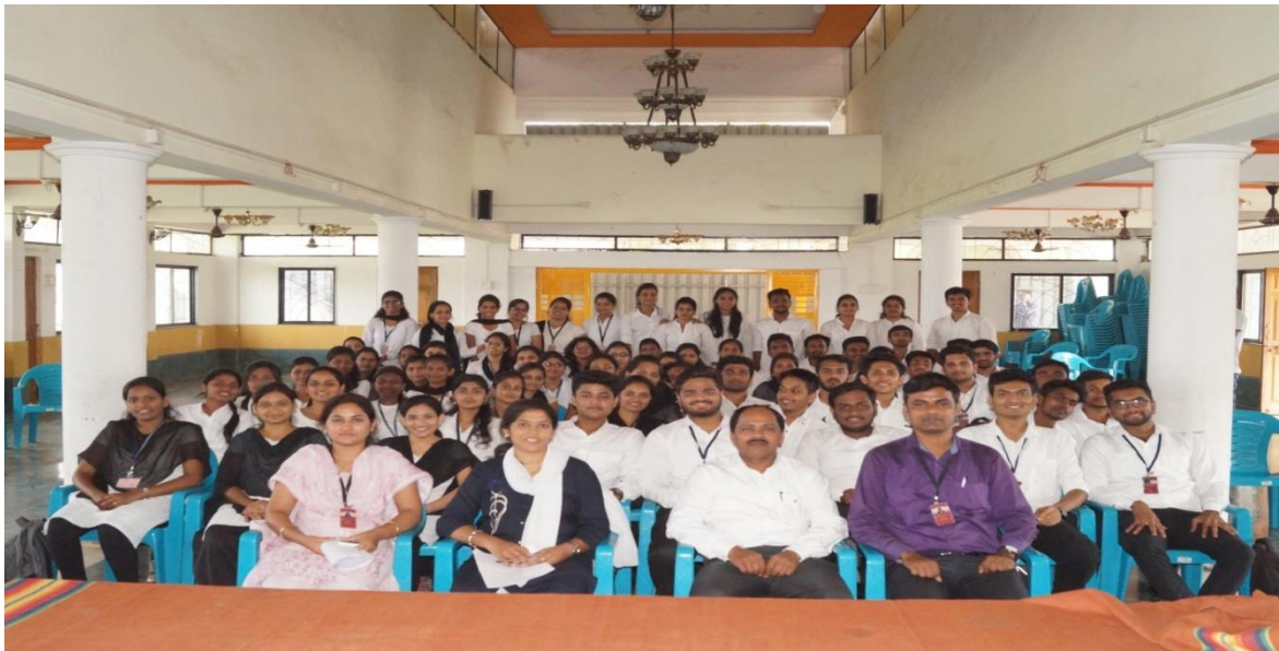
Community Service Study Visit by BE (A/B) at A.P. Ambewadi, Taluka-Karveer, Dist- Kolhapur, Dated-14/03/2018