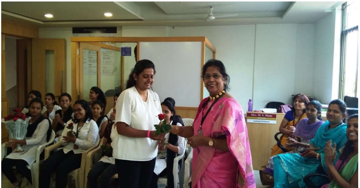
International Women's Day Celebration, Dated -08/03/2018