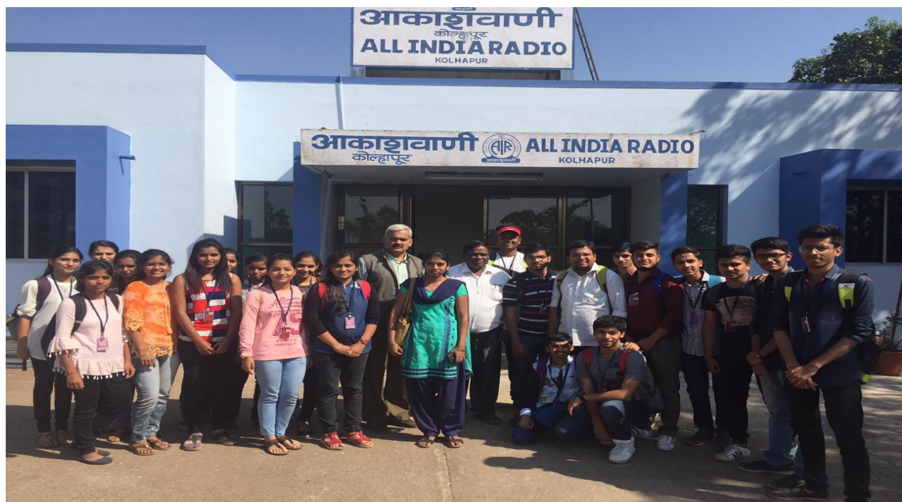
Industrial Visit to Prasara Bharati, Panhala