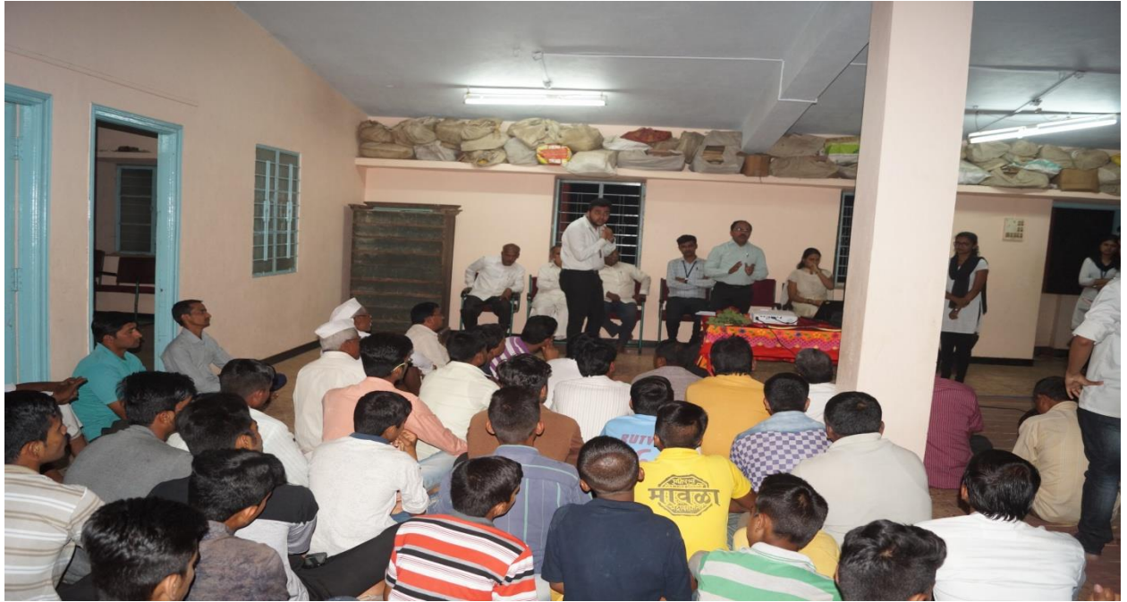
Community Service Study Visit by BE (A/B) at A./P. Donavade, Taluka-Karveer, Dist-Kolhapur, Dated-17/03/2018