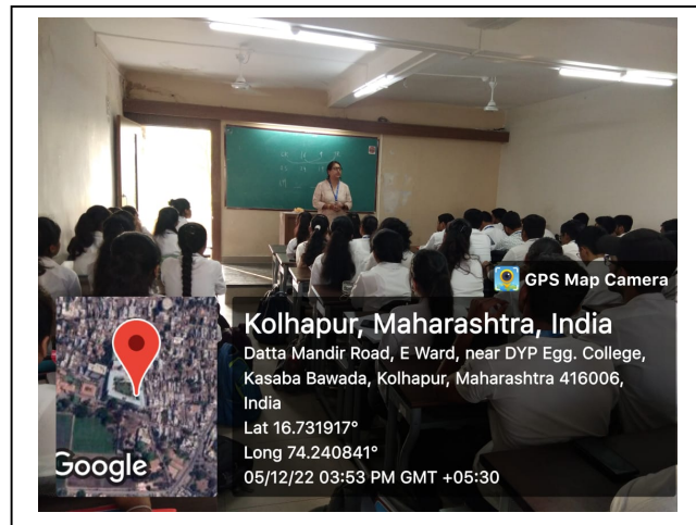
“Awareness about ICC” for F.Y. B. Tech. and F.Y. B.Arch. dated 5 th Dec. 2022