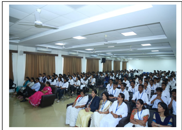
Seminar on “Cyber Bullying & Safe Use of Media” dated 26/09/2022