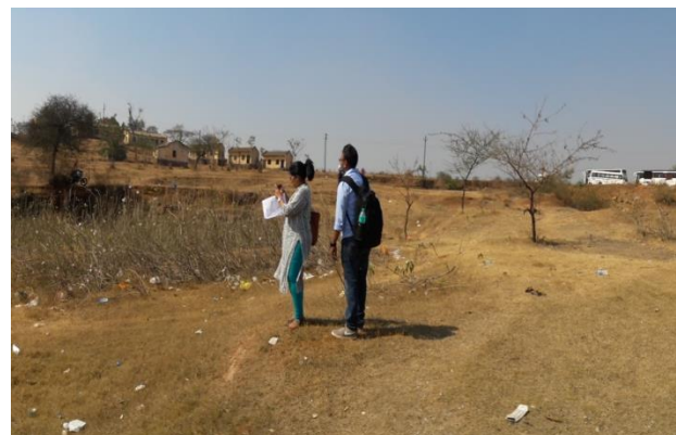
Visit to Rajaram Lake