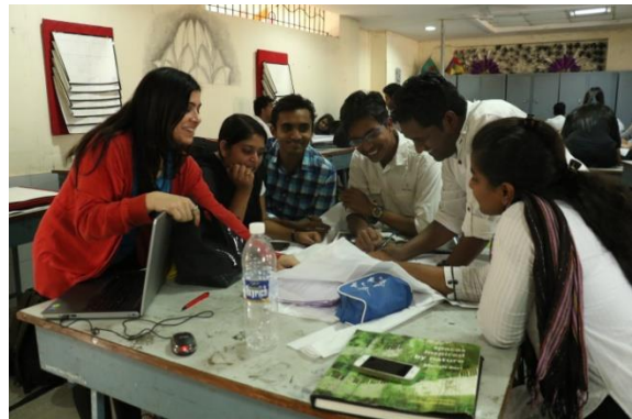
Students working in groups in studio