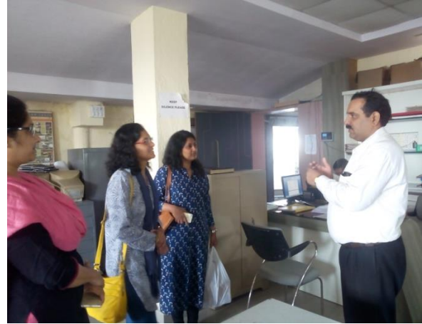
Interaction with the faculty