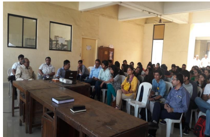
Meeting with the A.D.T.P. of Kolhapur city and presentation

On the second day the students visited the site, located near to Rajaram Lake. They took photographs draw sketches and also studied the contour levels of the site. Also the site context was studied by the students.