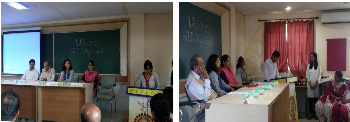
Welcoming the faculty and students of Sarvajanic College of architecture, Surat to department