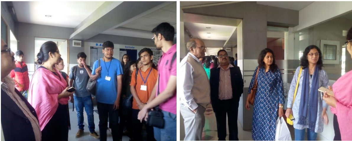
Informal discussion with the guests

It was 4 days workshop and among these 4 days, 2 days were given for the group work and site study. The third year students were involved with the SCET College students for the design workshop. On the first day the students visited the architecture department and then they had a discussion with the A.D.T.P. of Kolhapur city.