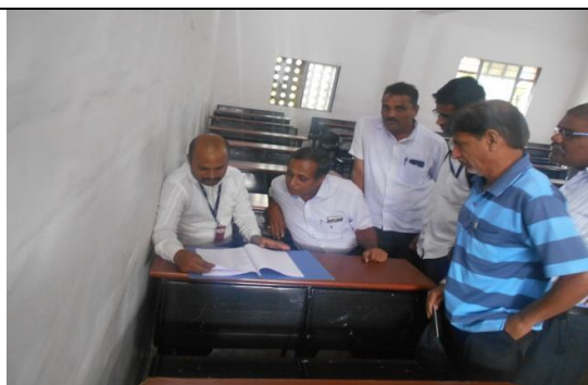
Interaction of Class teacher with Parents