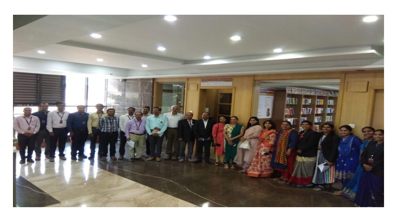
Alumni Meet, Dated- 02-02-19