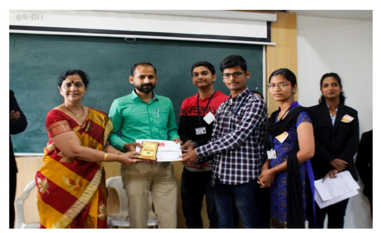
Project Competition, Dated- 14/2/19