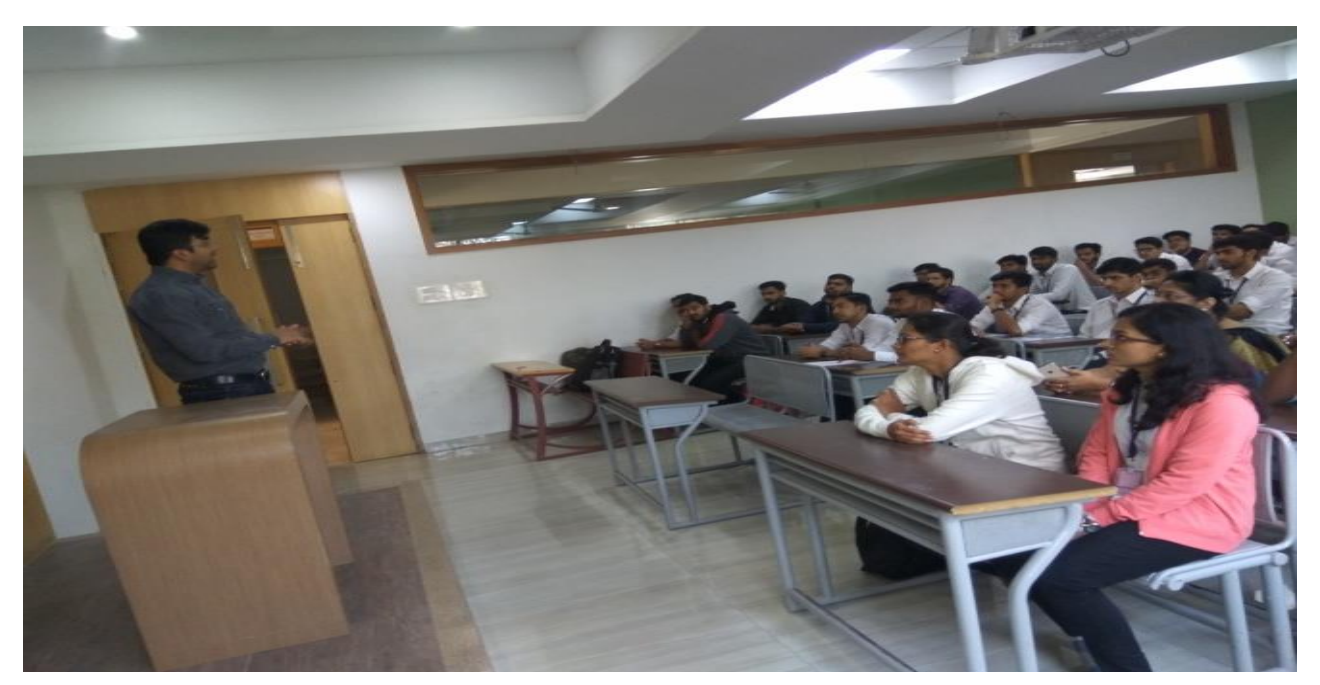
Industry readiness Program- TE (A), BE (B), Dated-15/1/19