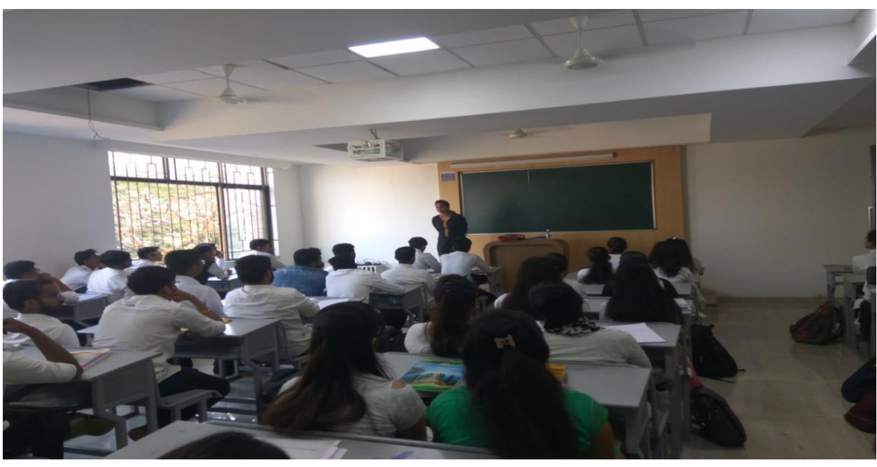
Company specific technical question & answer session, breathing Brains Institute, Dated- 5,\,6/2/19