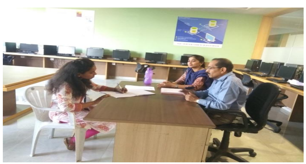
Mock Interview, Dated-7, 9,11,14,16 January 2019