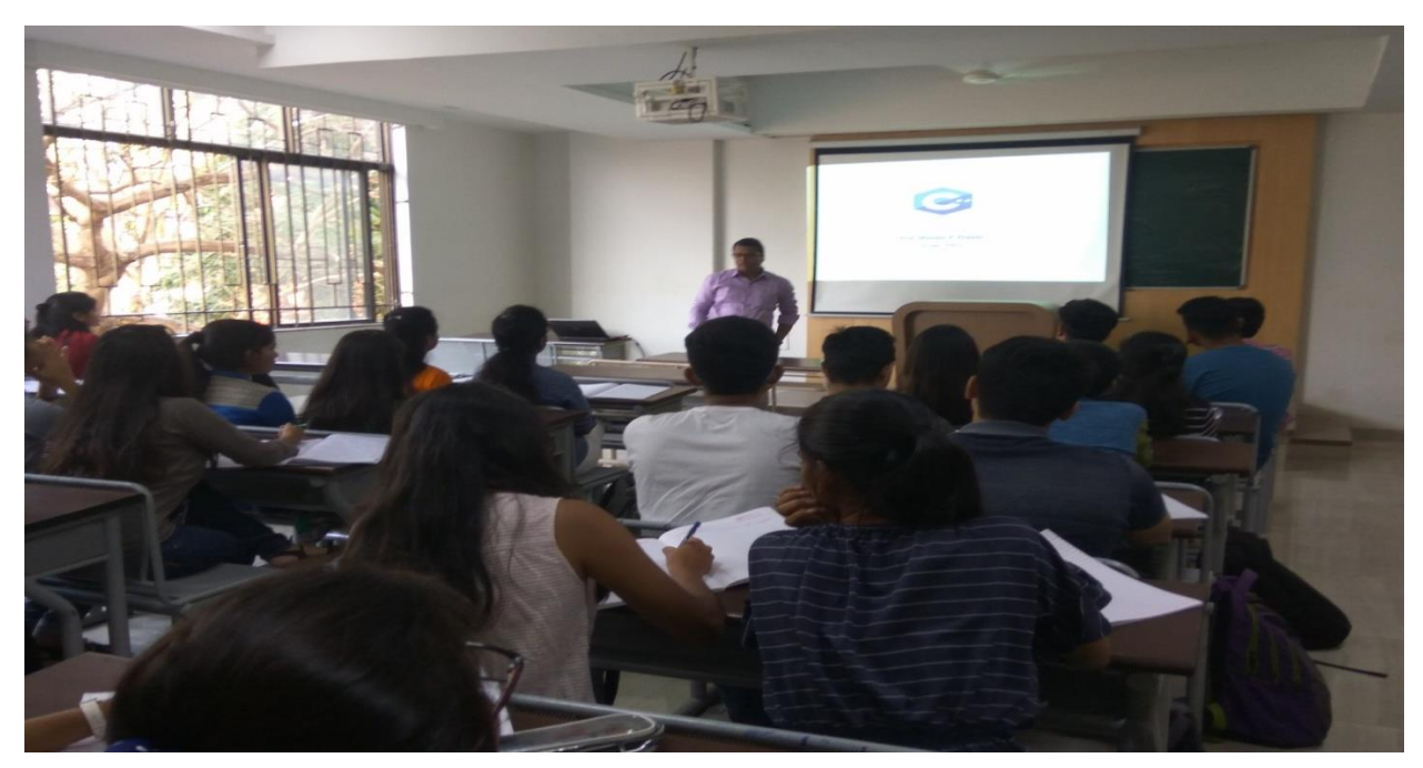
Company specific technical question & answer session, Dated-19 to 30/1/2019