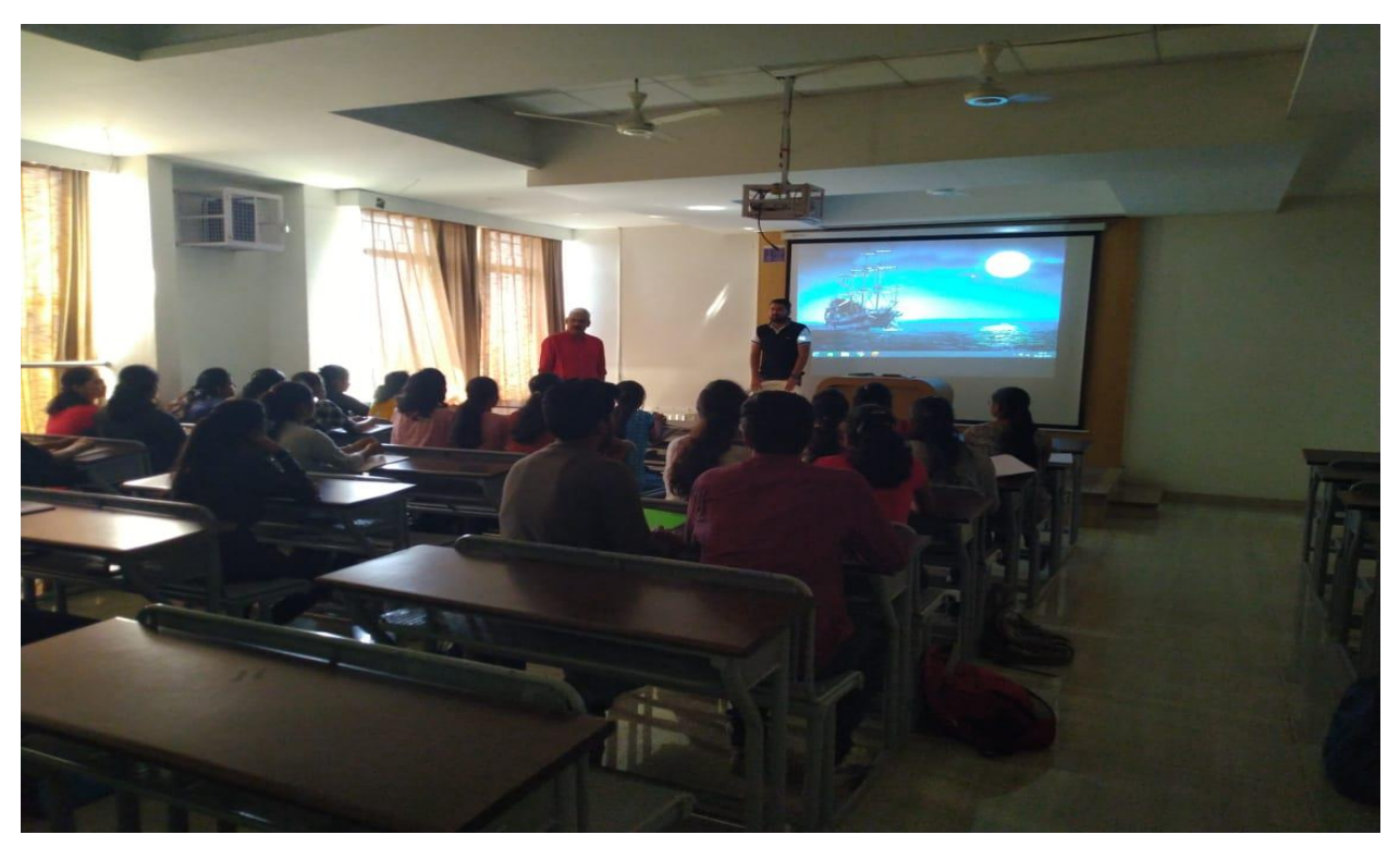
Guest Lecture on Computer Networks, Dated-6/2/19