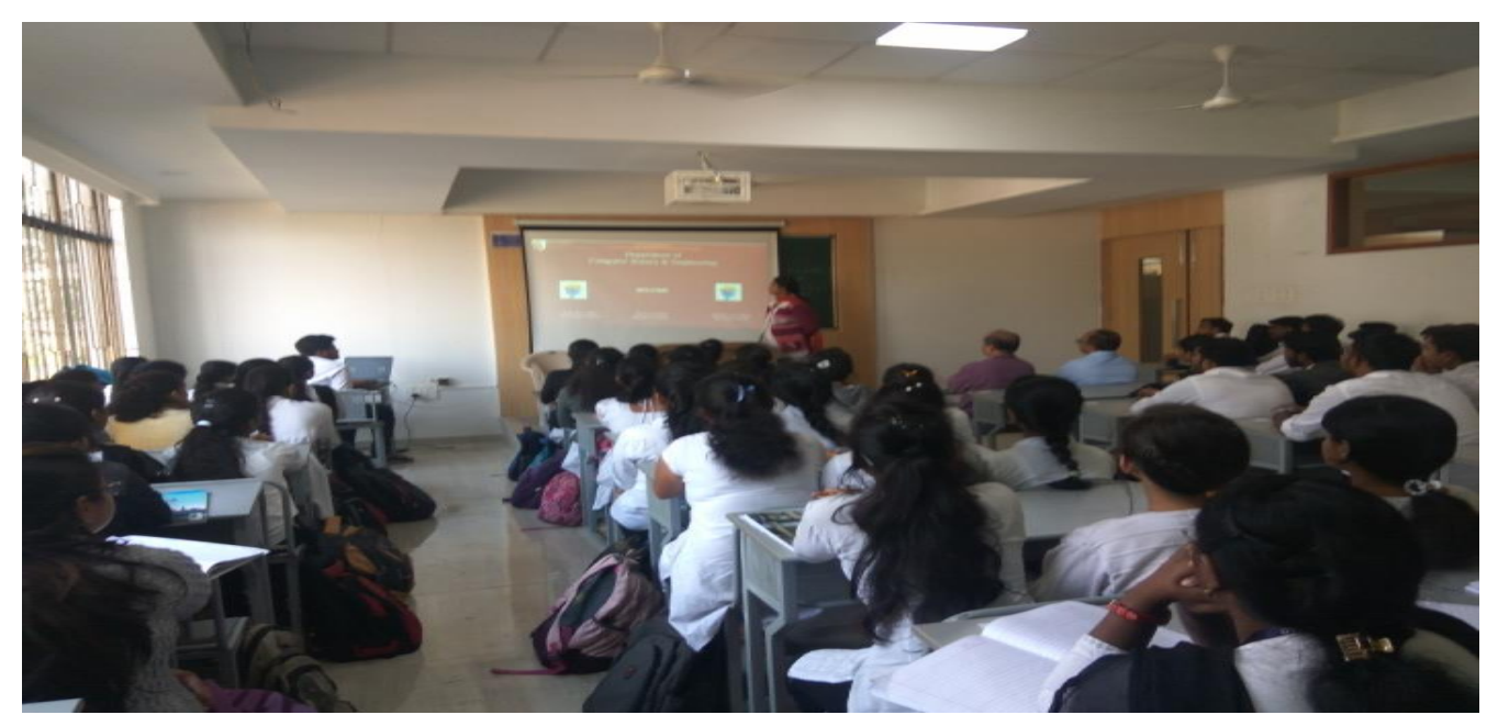
Seminar on Profile building, Dated-3/1/19