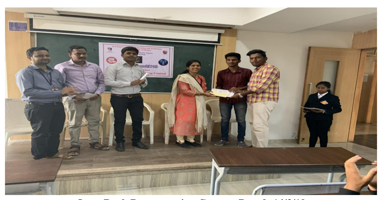
Open Book Programming Contest, Dated- 14/3/19