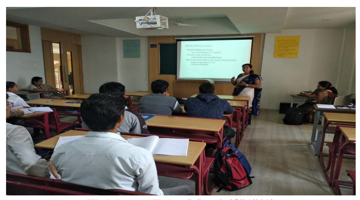
Workshop on "Hadoop", Dated- 25/01/2019