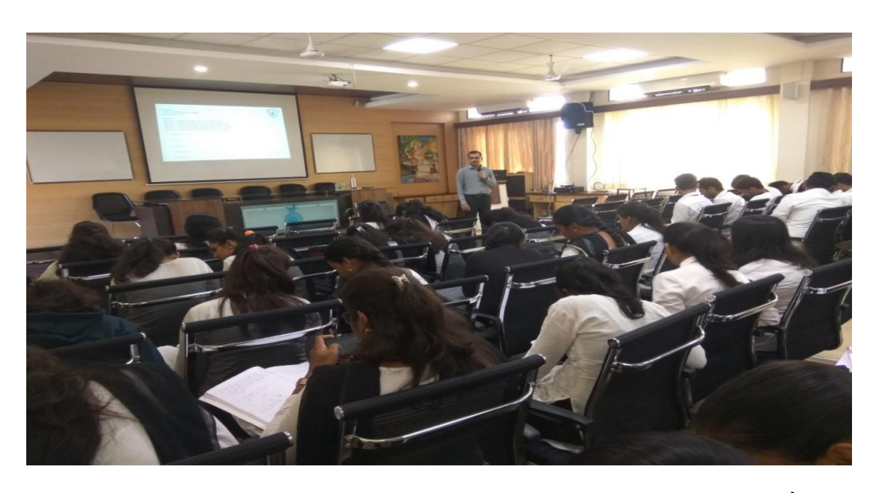
Company specific technical question & answer session for Syntel, Dated-25 th Feb. to 1^{\rm st} March 2019