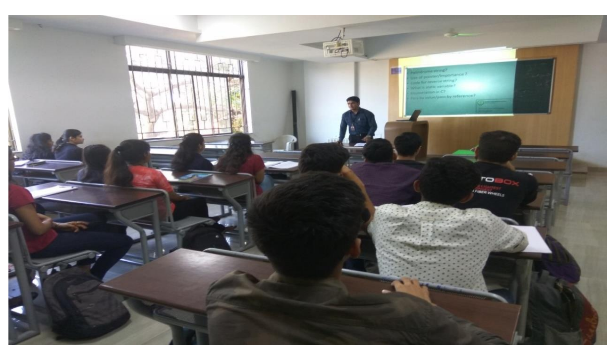
Company specific technical question & answer session (C, Data Structure, Java), Dated- 2/2/19\,