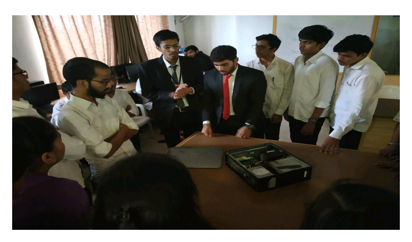
Linux Club Activity, Dated- 21/2/2019)