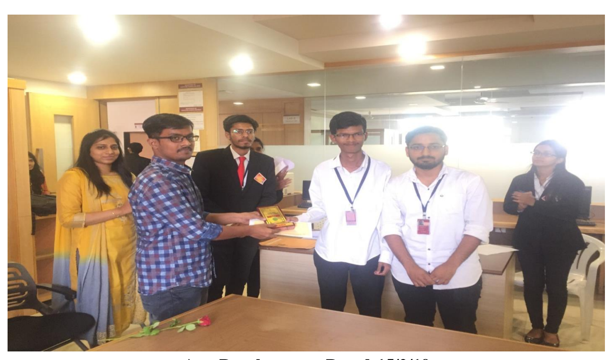
App Development, Dated-15/2/19