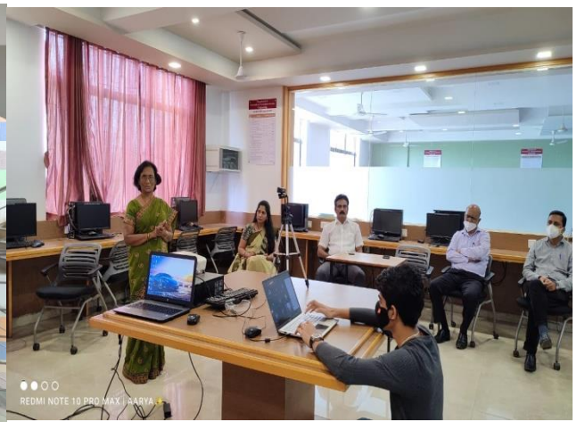
Quiz Competition Engineer's Day