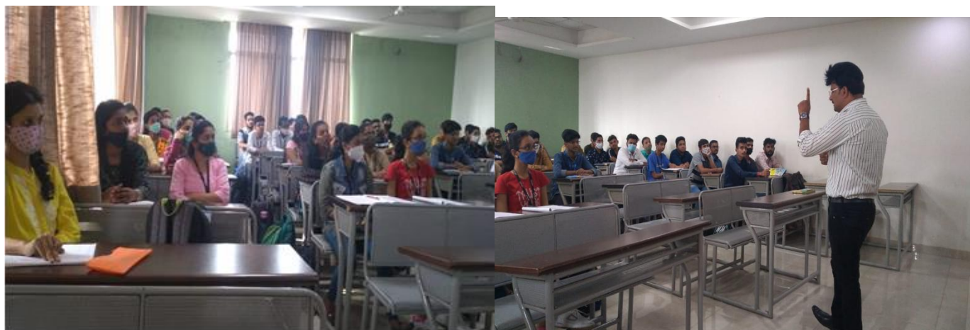
Expert lecture and one day hands on workshop