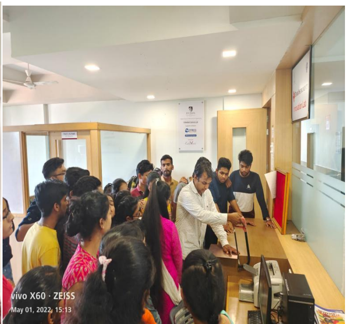
Workshop on PCB Designing Training