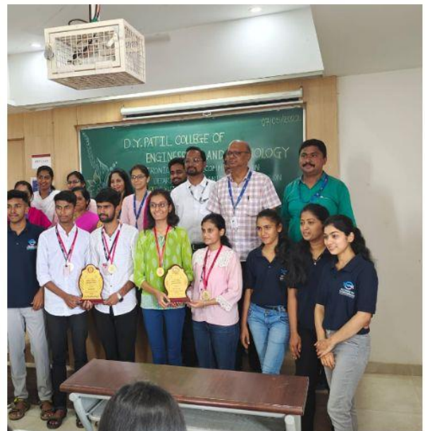
Seminar on Embedded and VLSI-Core electronics opportunities