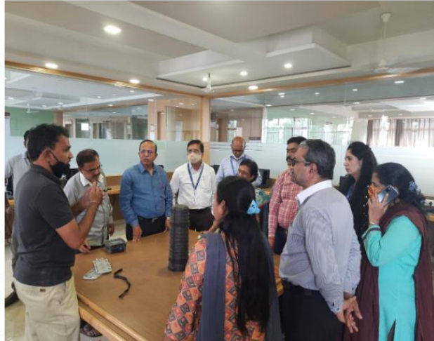
One Day Workshop on Optical Communication