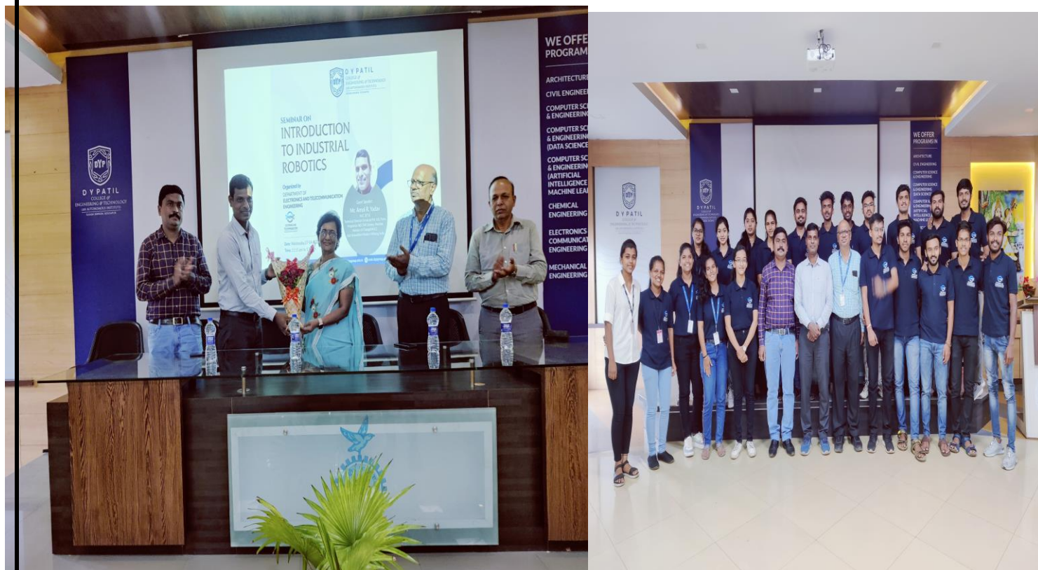
Seminar on Introduction to Industrial Robotics