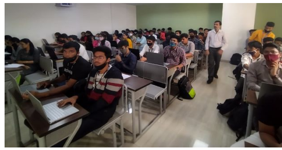
H. O. D