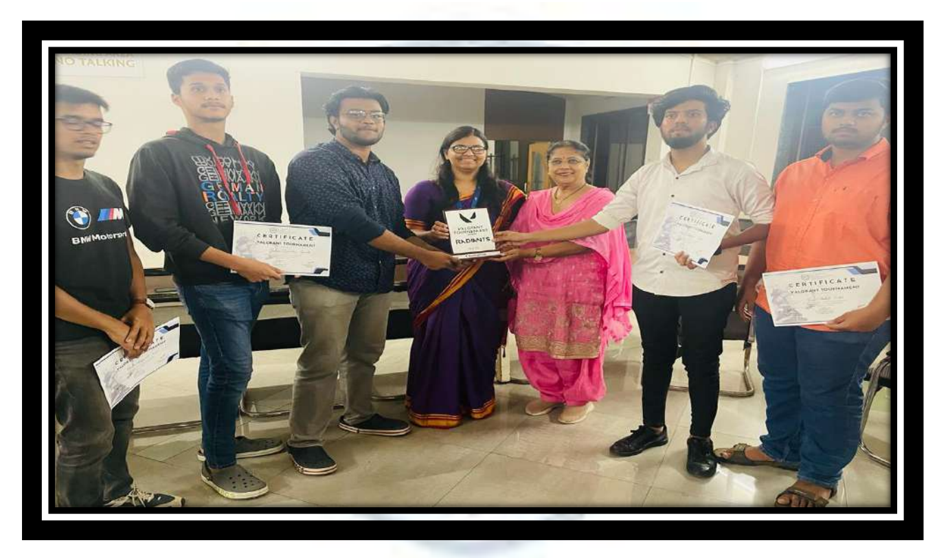
Runner-Up Team was Awarded with Certificate: -

Winning Team was Awarded with Trophy and Certificates