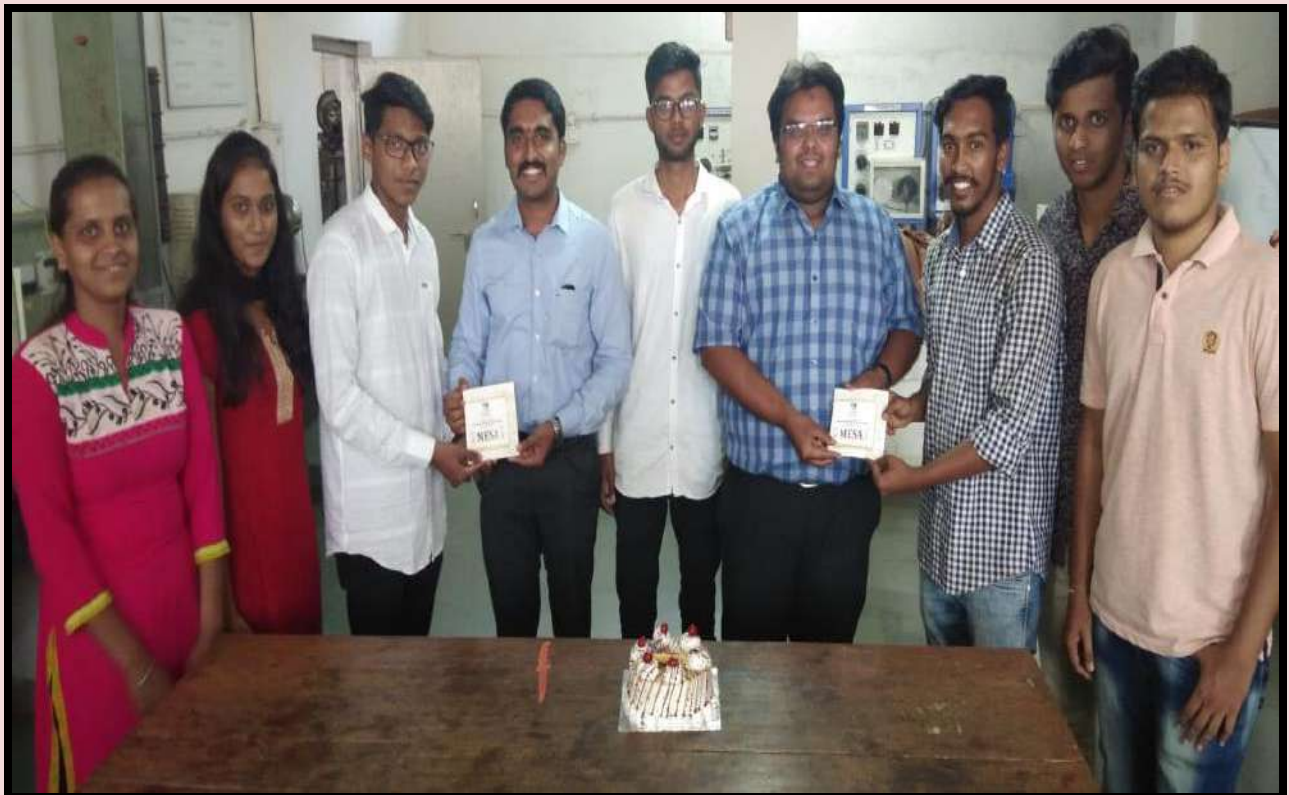
Birthday Celebration of Faculty members on the behalf of MESA