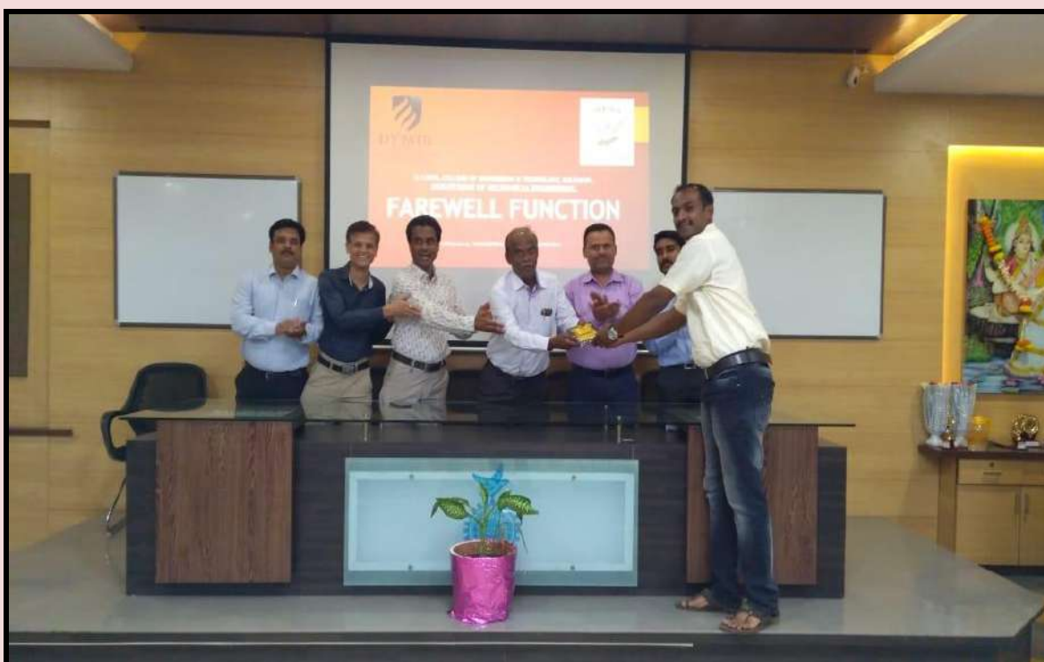
Distribution of certificates to final year students, MESA Office bearers & felicitation of technician of TIFAN