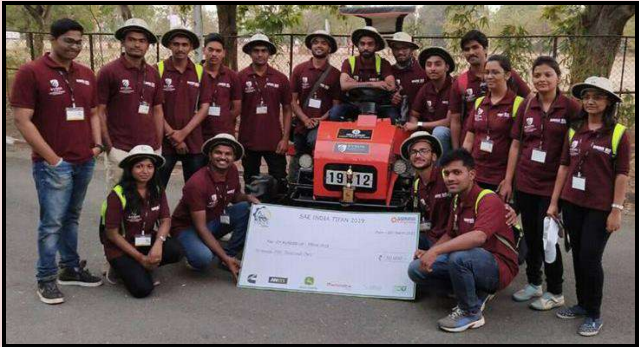
Team DYP CET has secured 2 nd Runner up prize in TIFAN 2019 which is held at MPKV, Rahuri.