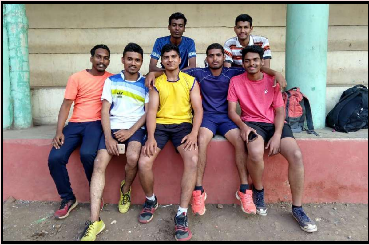
Mechanical Engineering Students have won General Championship 2019