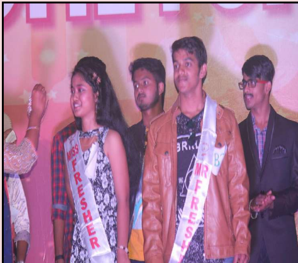
Welcome function for second year students