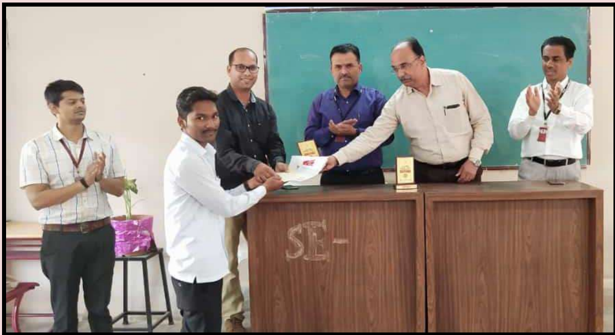
Conduction of Box Football, CAD Master & Lathe war event under Technotsav 2019 Date: 14 th & 15 th March 2019