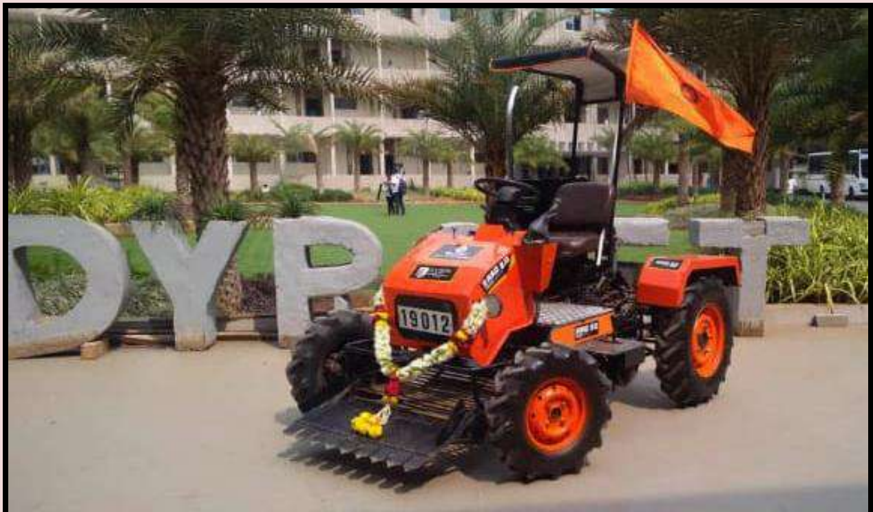
Self Propelled onion harvester developed by Team DYP CET