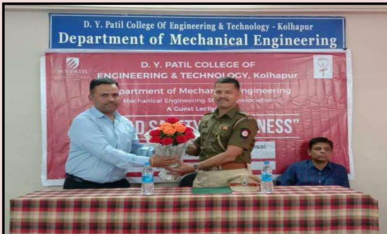
Felicitation of guest from the Head of Department

Date and Time of Guest Lecture: 22/01/2019, 11.00 am