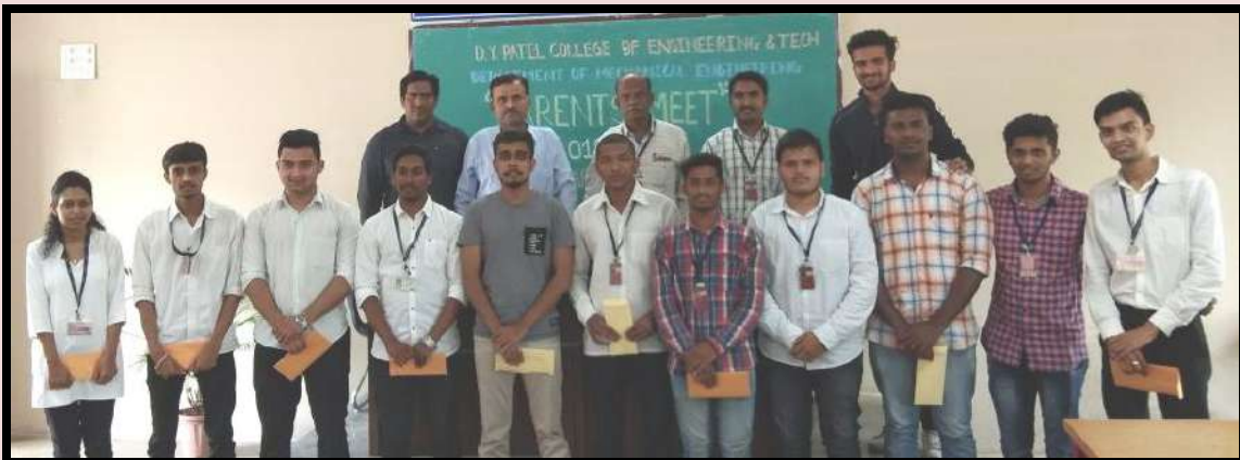
Formation of MESA Committee