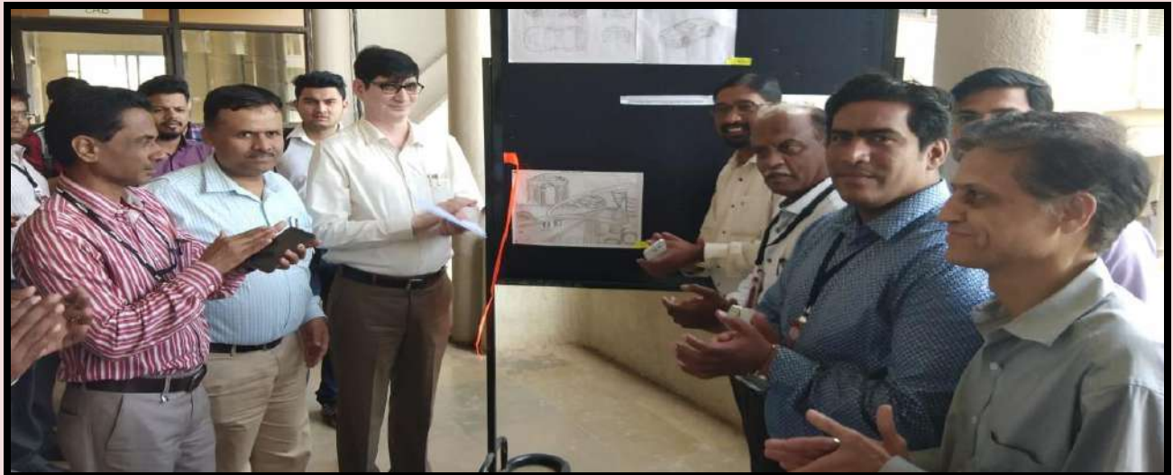
Talent Hunt event organized by Mechanical Engineering students