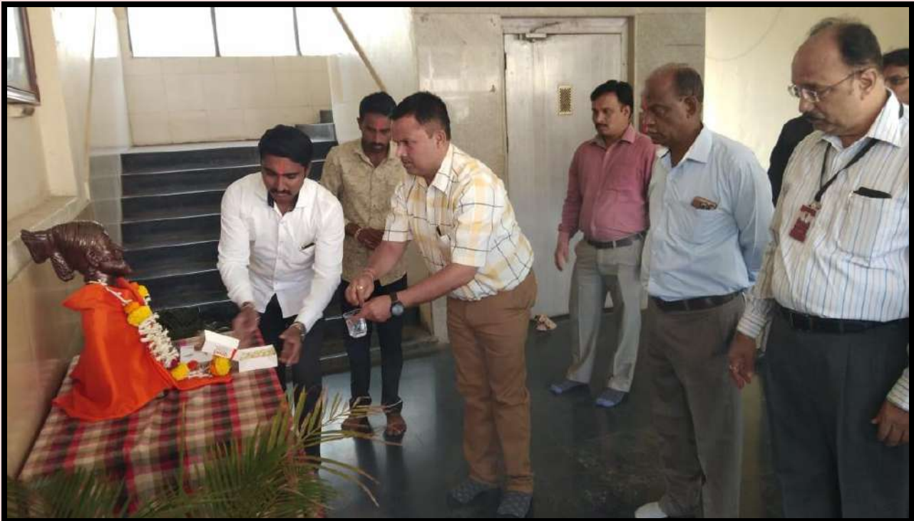
Celebration of Shivjayanti on the behalf of Mechanical Department Date: 19 th February 2019