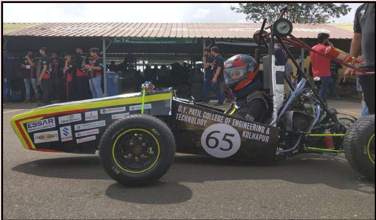
Student Formula car developed by Team DYP Motorsports