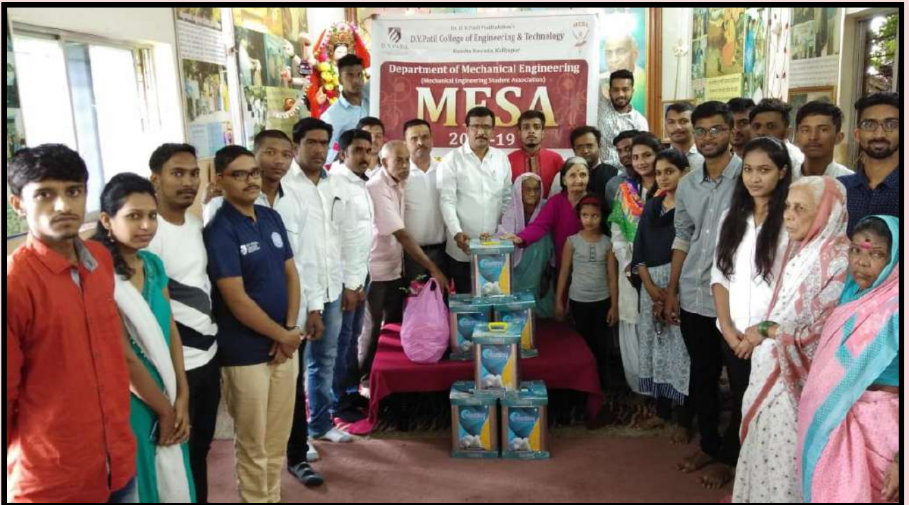
Donation Campaign at Matoshri Vrudhh Ashram on the occasion of Independence Day

Date and Time of Activity: 15/08/2018, 10 am