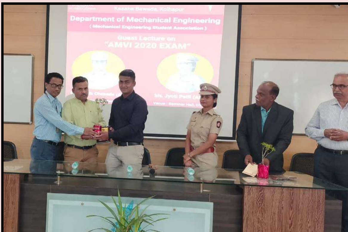
Felicitation of Guests