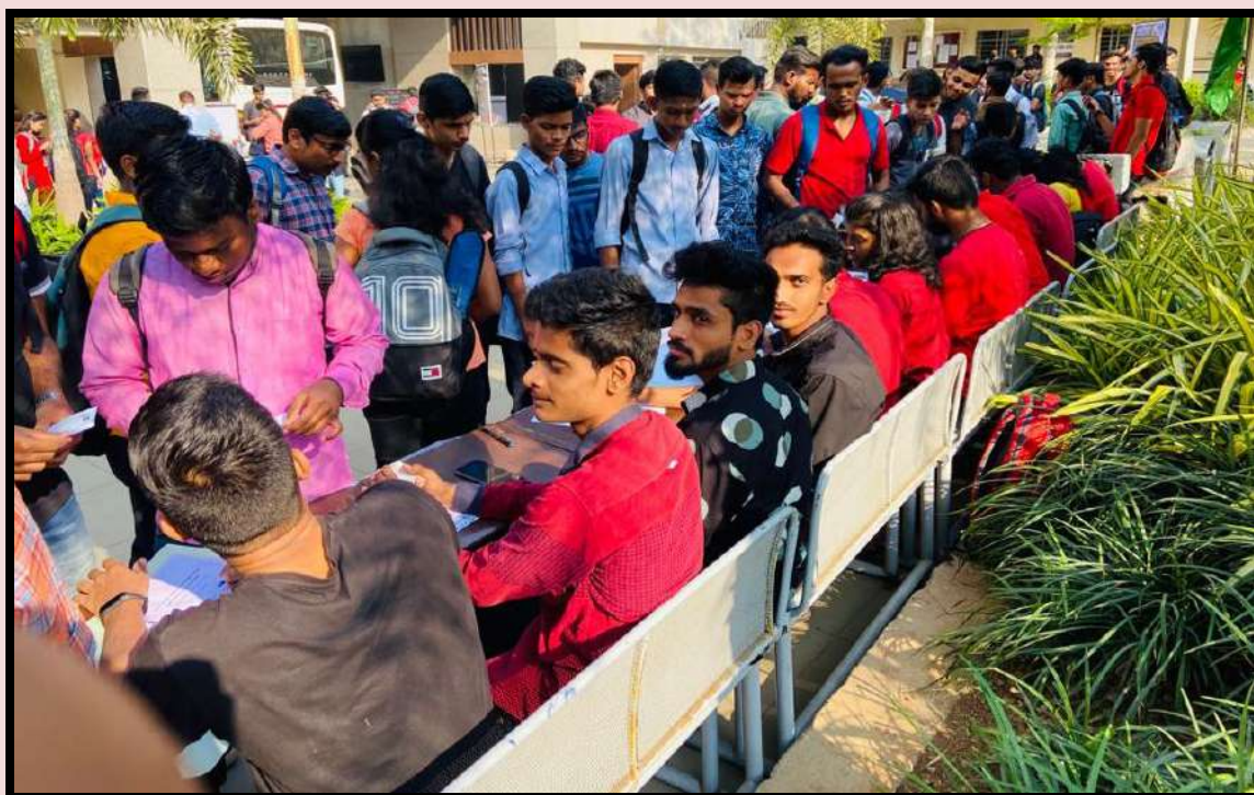
Registration of INFINITY 2K20 Participants from various colleges