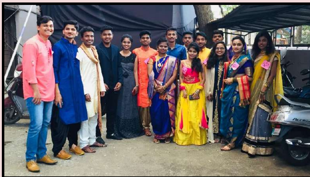
Welcome function of S.E Students