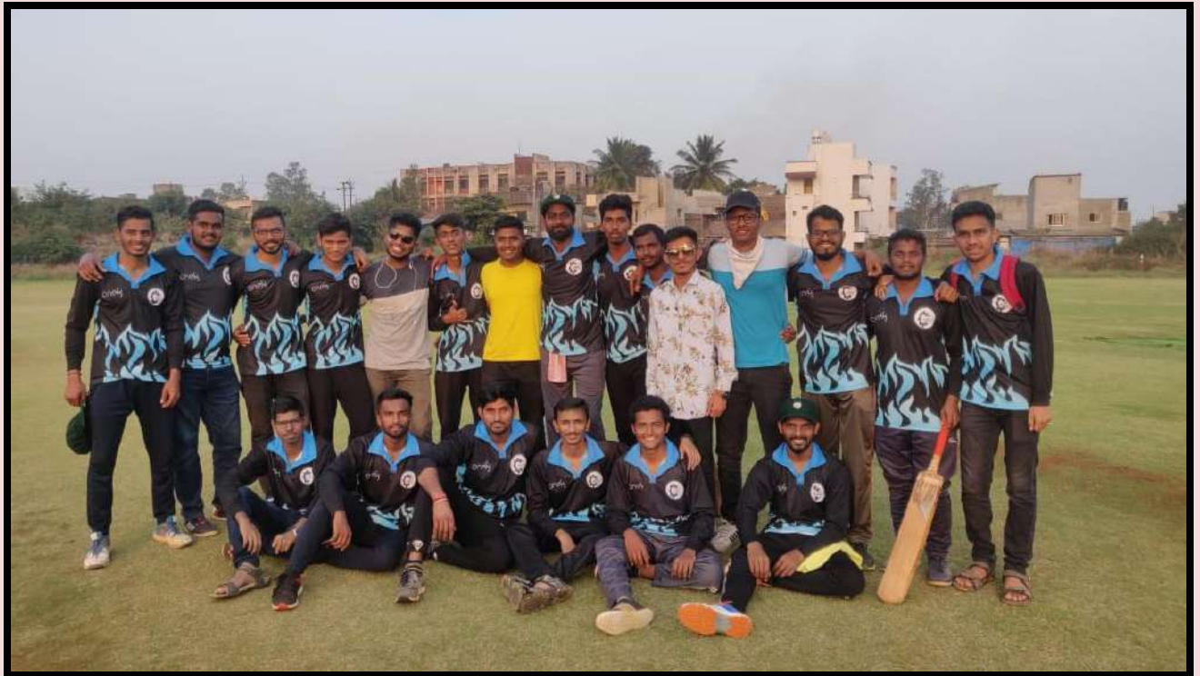
Mechanical Engineering Students have won General Championship 2020