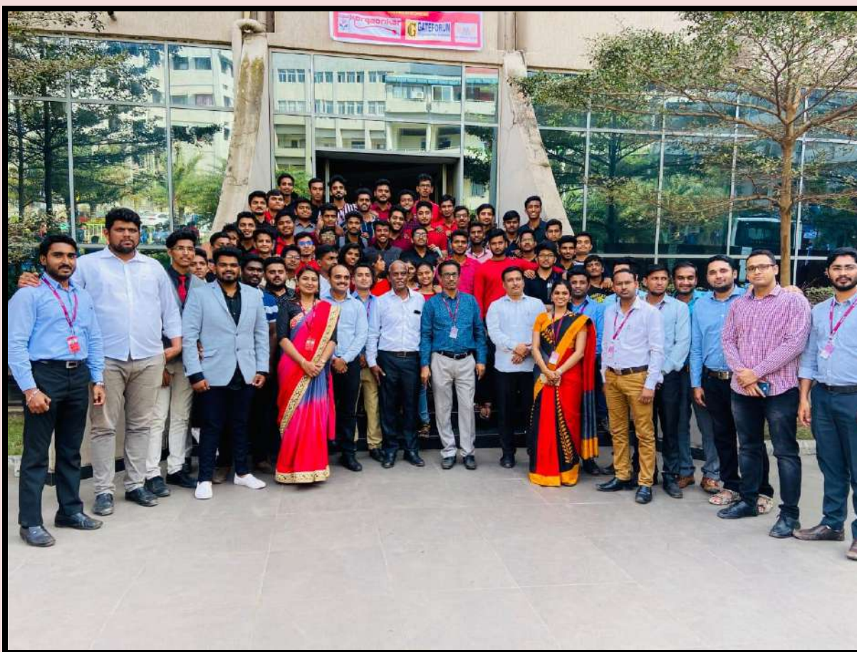
INFINITY 2K20 Volunteers with teaching staff & committee members