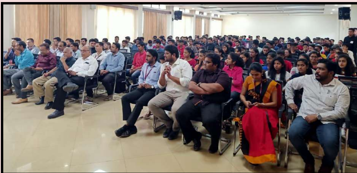
Inaugural function of INFINITY 2K20