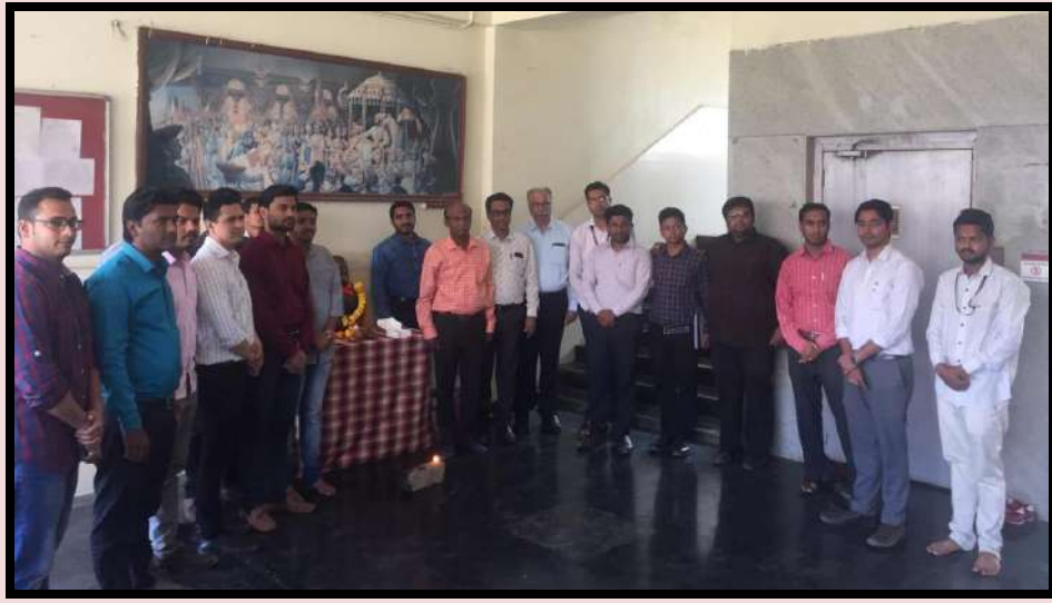
Celebration of Shivjayanti on the behalf of Mechanical Department