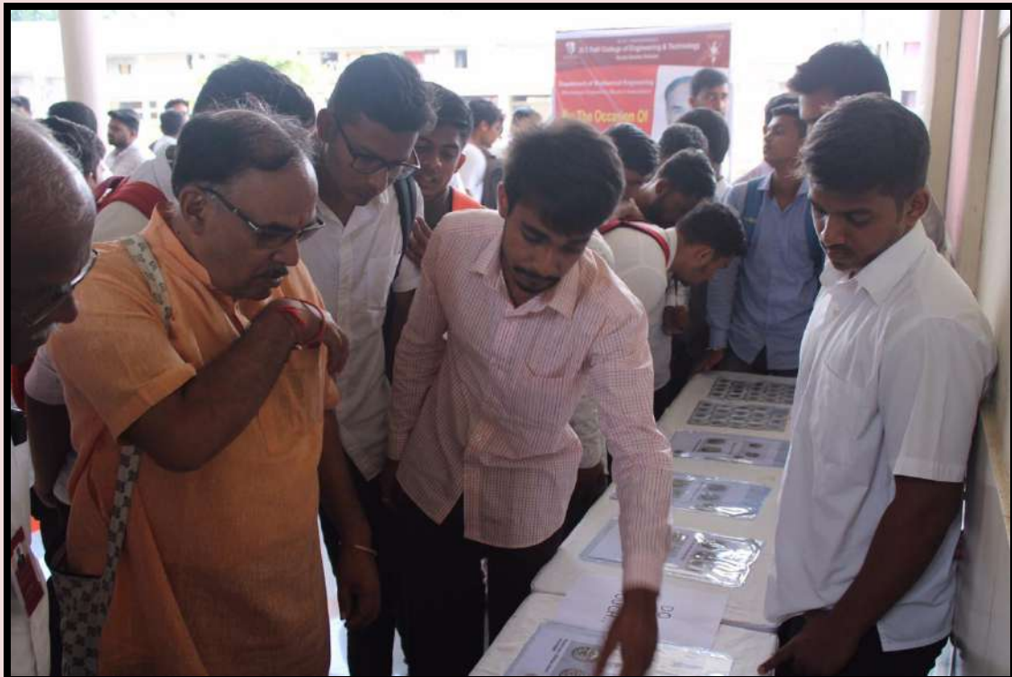
Heritage Coin Exhibition (Coin Collection by - Mr. Vishwajeet Mohite Pati)