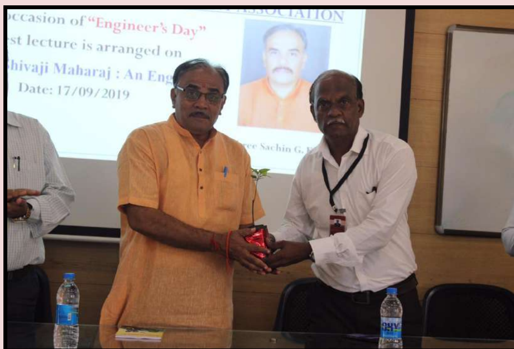
Felicitation of guest from the Head of Department