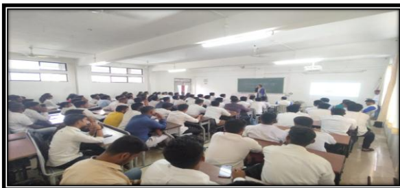
Workshop on IPR for Students of College