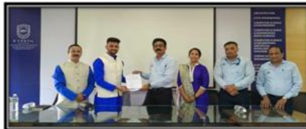
MoU with MyCrave Consultancy Pvt. Ltd. Baroda