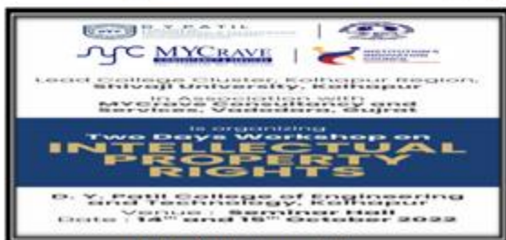
1 Day Workshop on IPR