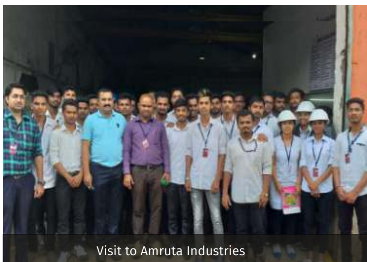
Visit to Amruta Industries