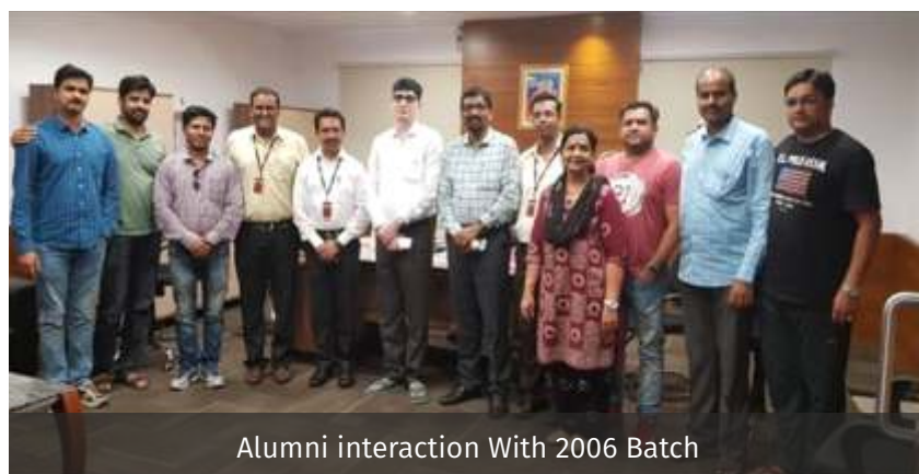
Alumni interaction With 2006 Batch