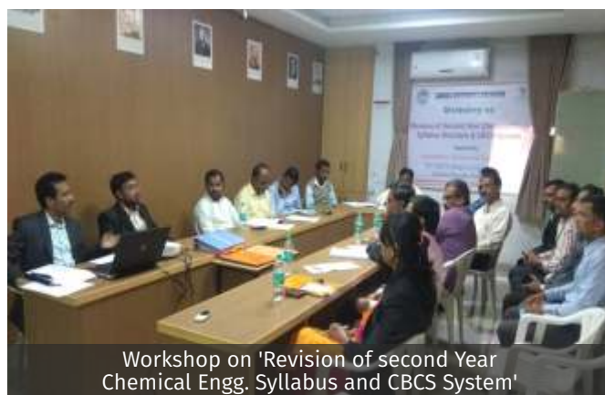
Workshop on 'Revision of second Year Chemical Engg. Syllabus and CBCS System'