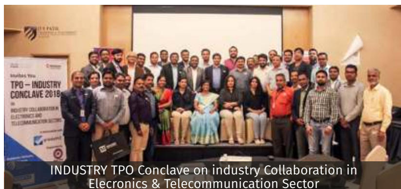
INDUSTRY TPO Conclave on industry Collaboration in Electronics & Telecommunication Sector