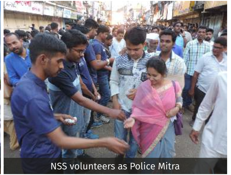
NSS volunteers as Police Mitra