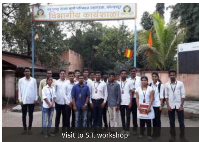
Visit to S.T. workshop