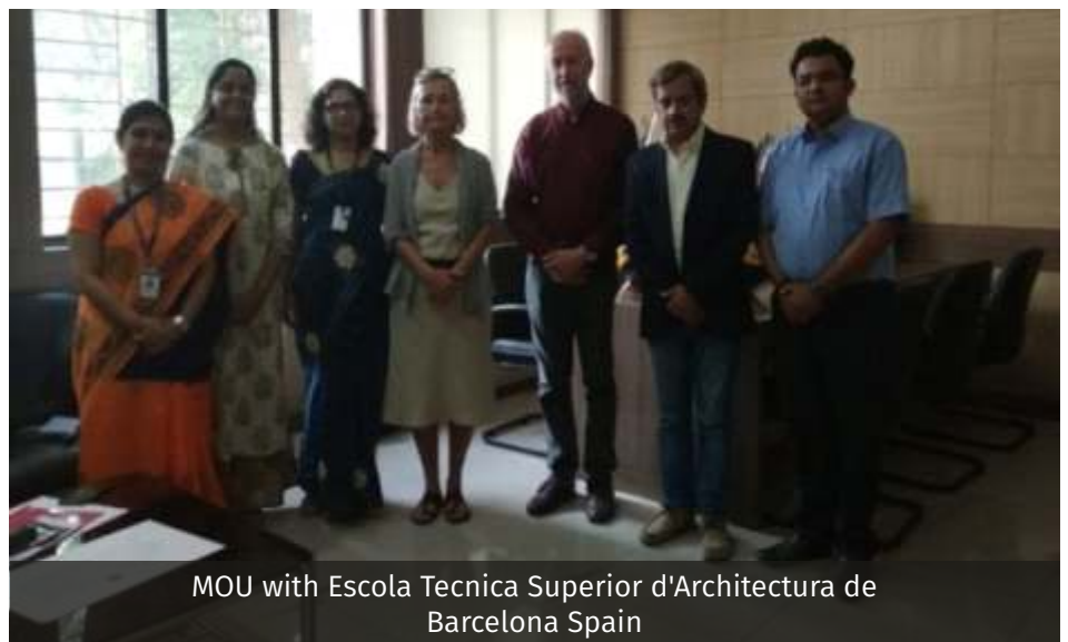
MOU with Escola Tecnica Superior d'Architectura de Barcelona Spain