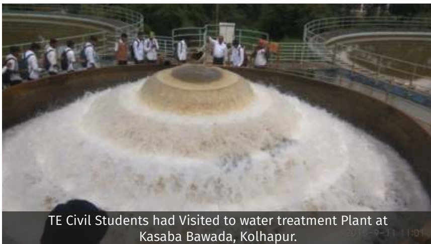
TE Civil Students had Visited to water treatment Plant at Kasaba Bawada, Kolhapur.