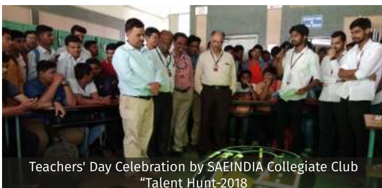
Teachers' Day Celebration by SAEINDIA Collegiate Club "Talent Hunt-2018"