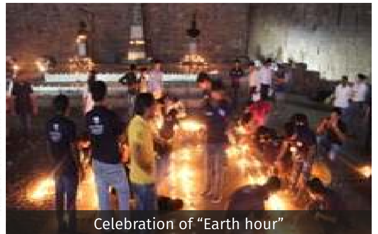
Celebration of "Earth hour"