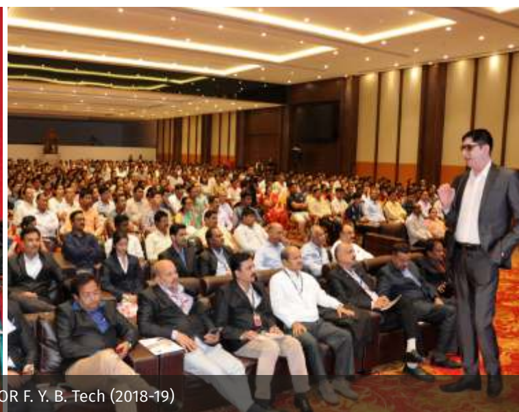
ORIENTATION PROGRAMME FOR F. Y. B. Tech (2018-19)