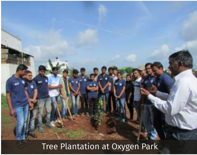
Tree Plantation at Oxygen Park