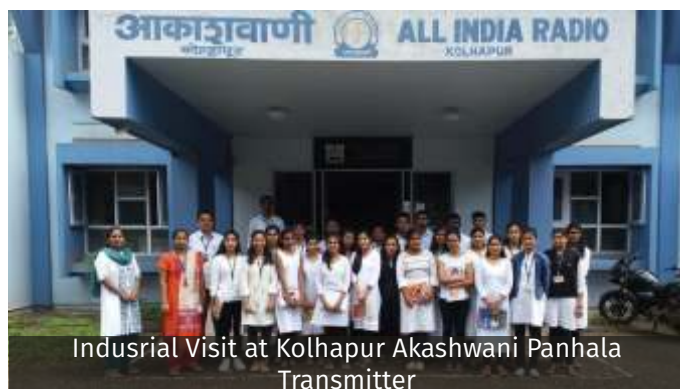
Industrial Visit at Kolhapur Akashwani Panhala Transmitter