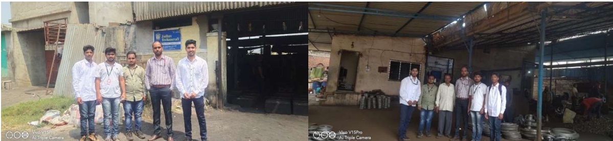
Industrial Visit to JadhavTechnocraft Ltd