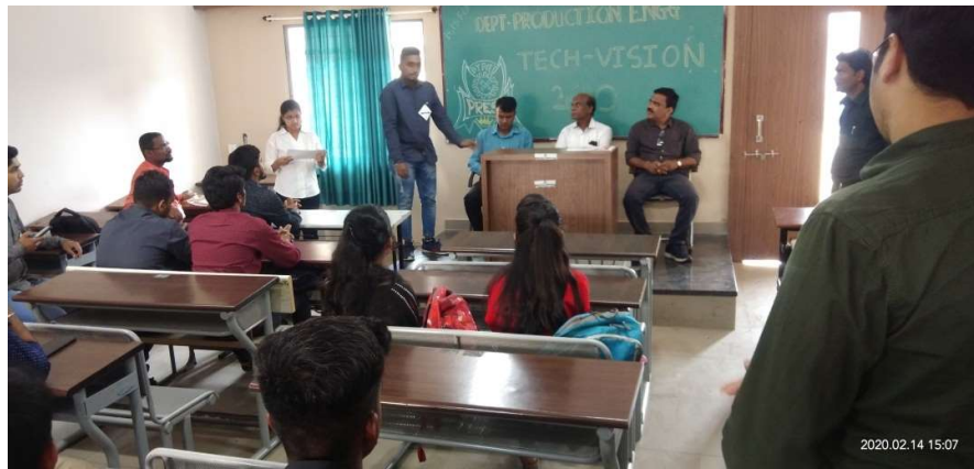
Prize Distribution of Event – Chess