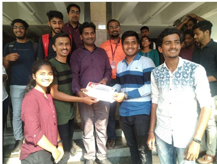
Prize Distribution of Event – Hunt It –Treasure Hunt