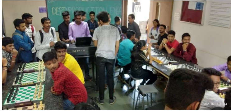
Techvision 2020 Event- Brain Game-Chess