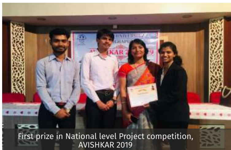
First prize in National level Project competition, AVISHKAR 2019