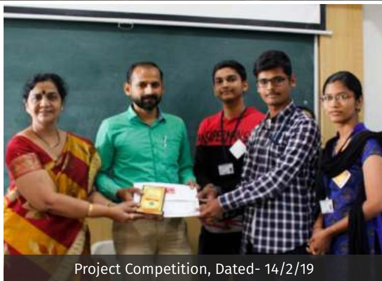
Project Competition, Dated- 14/2/19