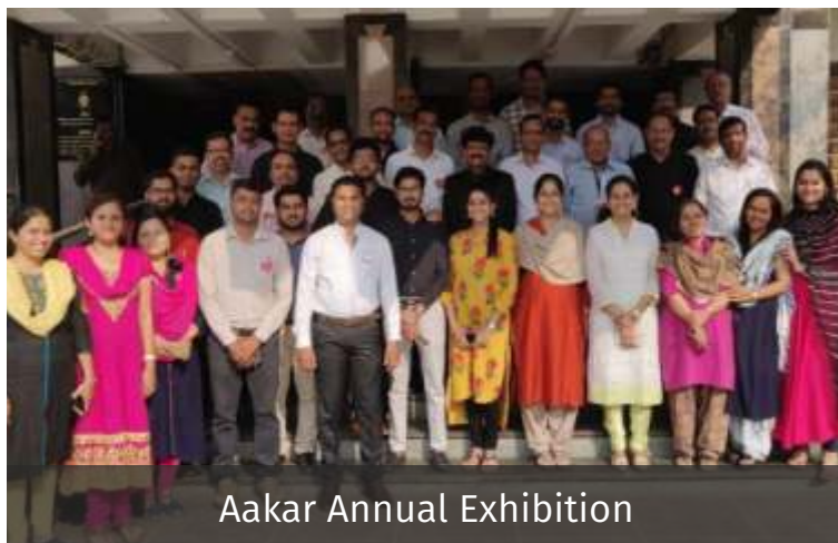
Aakar Annual Exhibition