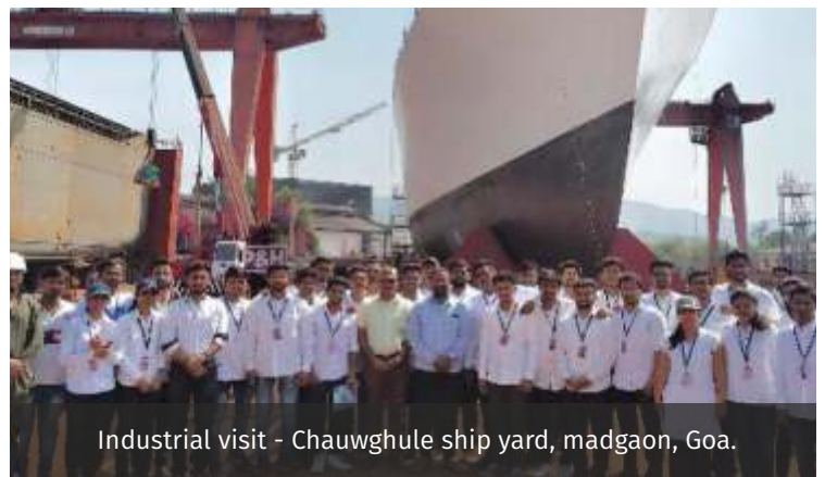
Industrial visit - Chauwghule ship yard, madgaon, Goa.