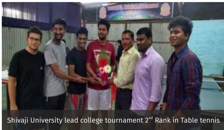
Shivaji University lead college tournament 2 nd Rank in Table tennis