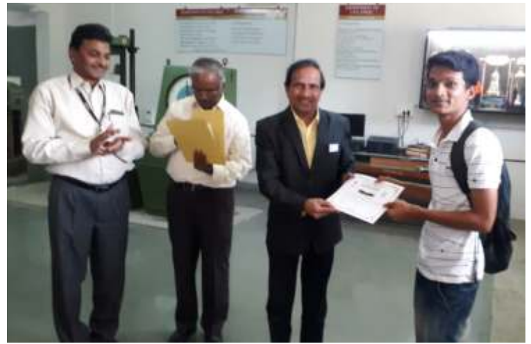
Technical Even at Technotsav, Structural Model Making (Arch Beam) & Technical Extempore Speech