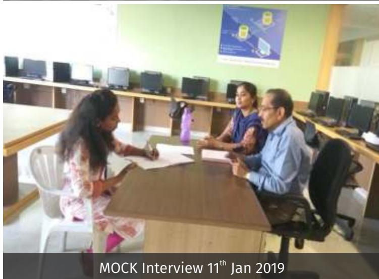
MOCK Interview 11 th Jan 2019