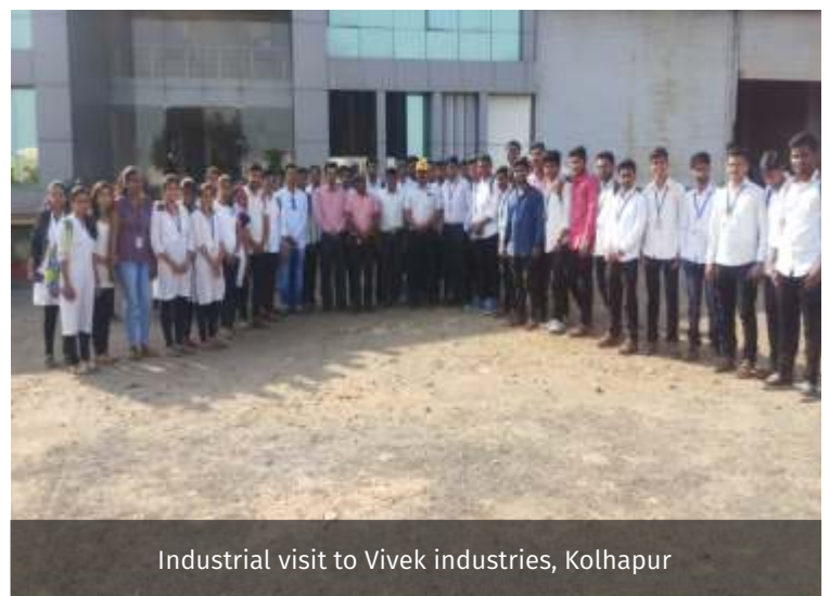
Industrial visit to Vivek industries, Kolhapur