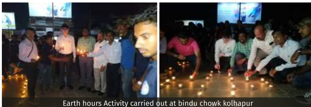
Earth hours Activity carried out at bindu chowk kolhapur