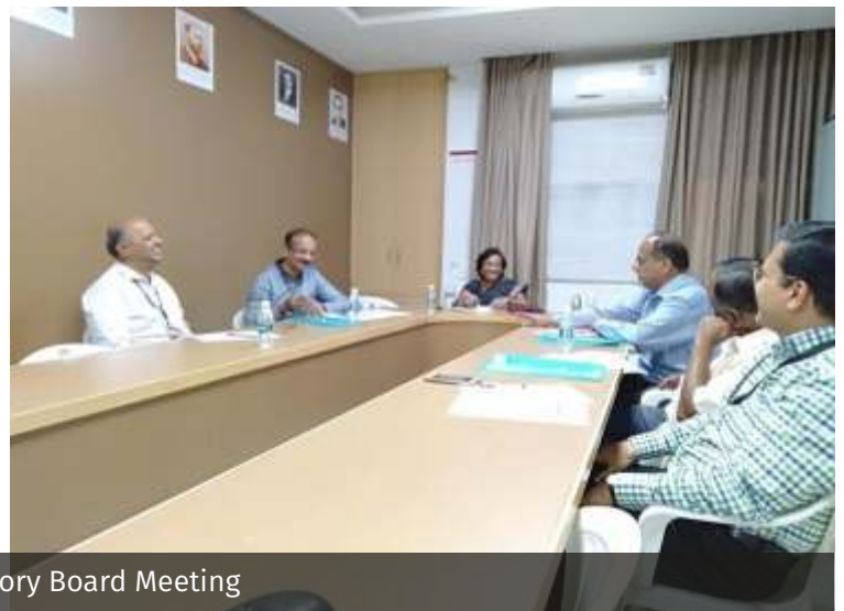
Department Advisory Board Meeting