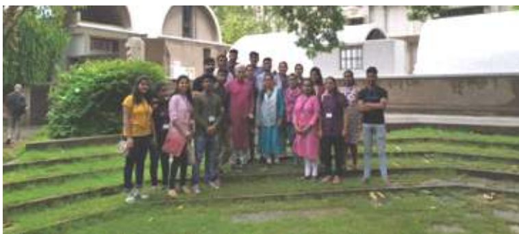
Study Tour to Ahmedabad and visit to Ar. B.V.Doshi's office Sangath –Vastu Shilpa.