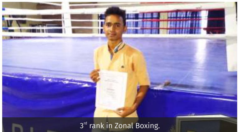
3 rd rank in Zonal Boxing.