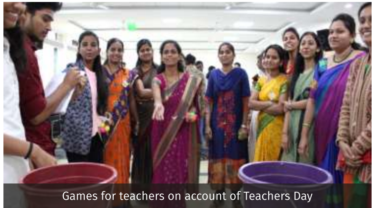
Games for teachers on account of Teachers Day