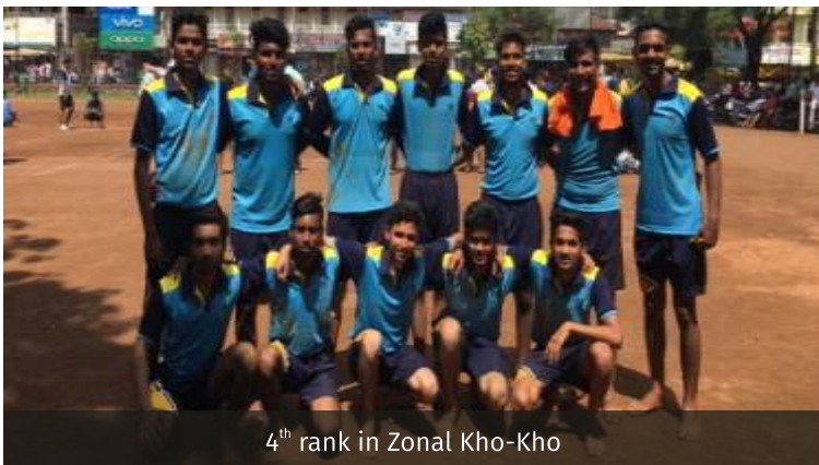
4 th rank in Zonal Kho-Kho