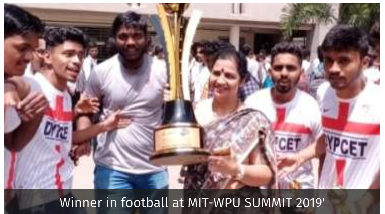
Winner in football at MIT-WPU SUMMIT 2019'