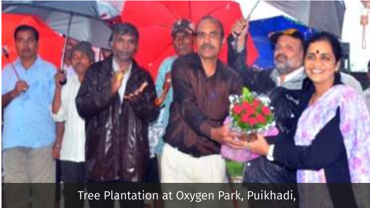
Tree Plantation at Oxygen Park, Puikhadi,