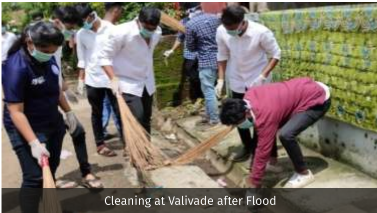
Cleaning at Valivade after Flood