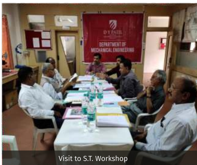
Visit to S.T. Workshop