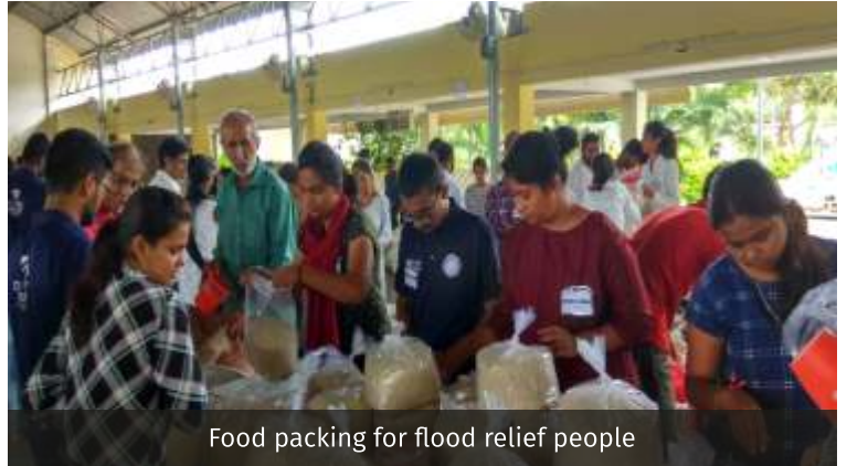
Food packing for flood relief people