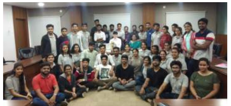
Winner – General Championship and Reuben's trophy (Citation) for Zonal NASA-2019 at Jawaharlal Nehru Engineering College, Aurangabad.