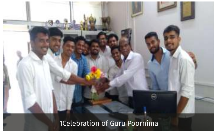
1 Celebration of Guru Purnima