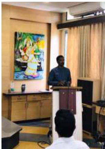
Guest Lecture on "Ayurveda Yoga and Human Health"