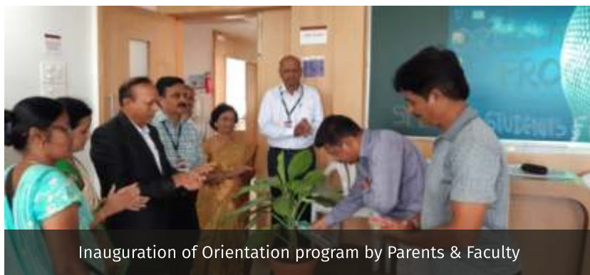
Inauguration of Orientation program by Parents & Faculty