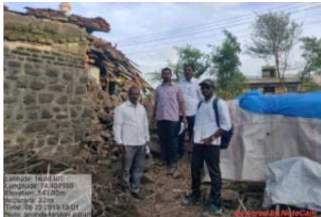
Civil Department students & staff involved in Damage Assessment work at Hatkanagle division