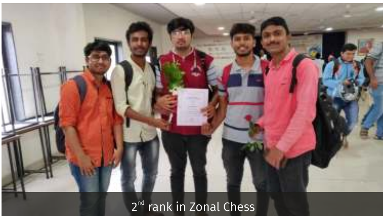
2 nd rank in Zonal Chess