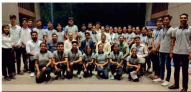
CAMPUS PLACEMENT DRIVE-SANKEY SOLUTION