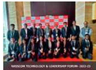
NASSCOM TECHNOLOGY & LEADERSHIP FORUM - 2022-23