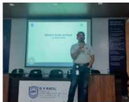
PRE-PLACEMENT WHEELS INDIA