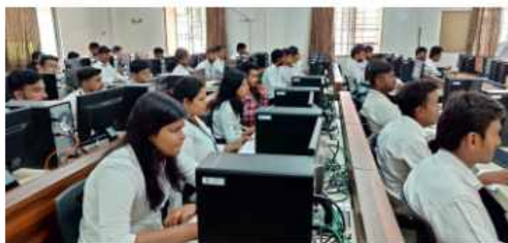
CAMPUS PLACEMENT DRIVE RLE INTERNATIONAL TECHNICAL TEST