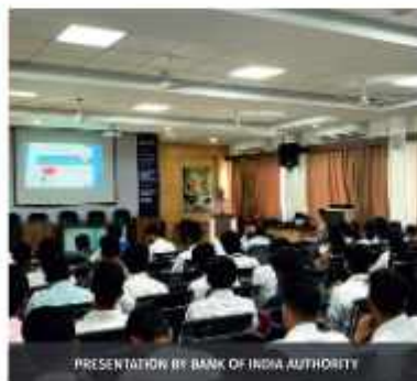
PRESENTATION BY BANK OF INDIA AUTHORITY