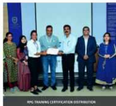
TPO TRAINING CERTIFICATION DISTRIBUTION