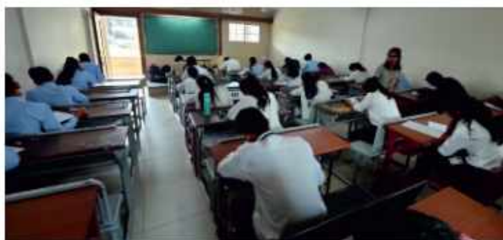
APTITUDE TEST OF TATA ELXSI