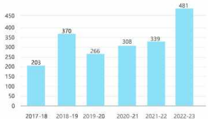
On Campus Placement In progress