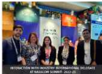
INTERACTION WITH INDUSTRY INTERNATIONAL DELEGATE AT NASSCOM SUMMIT - 2022-23