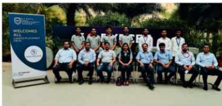
CAMPUS PLACEMENT DRIVE-WHEELS INDIA