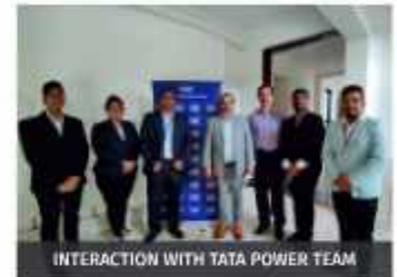
INTERACTION WITH TATA POWER TEAM