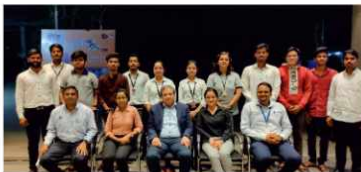
CAMPUS PLACEMENT DRIVE-PRIVI CHEMICAL