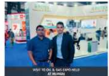
VISIT TO OIL & GAS EXPO HELD AT MUMBAI