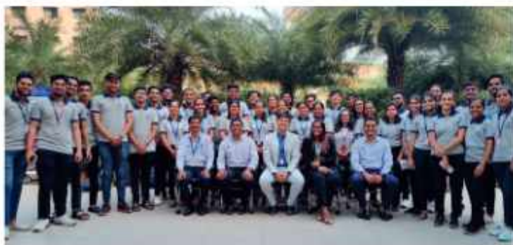
CAMPUS PLACEMENT DRIVE-TATA ELXSI