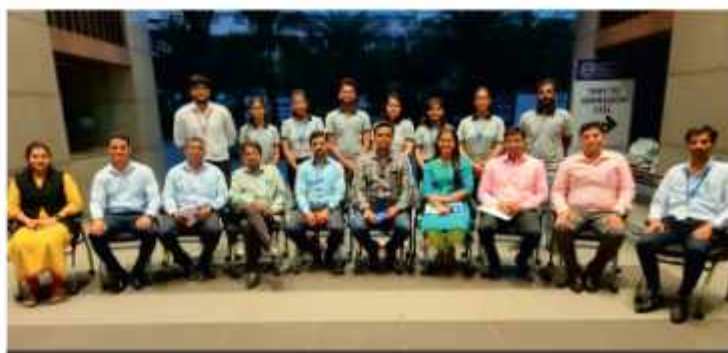
CAMPUS PLACEMENT DRIVE-ICOGNITION