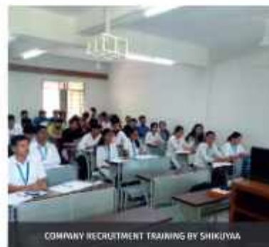
COMPANY RECRUITMENT TRAINING BY SHIKUYAA