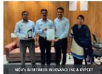
MOU'S IN BETWEEN INDOWANCE INC & DVVPCET