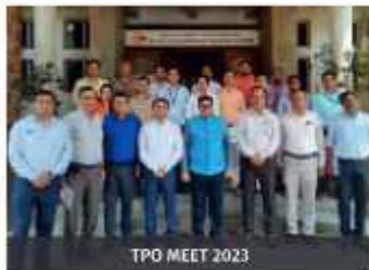
TPO MEET 2023